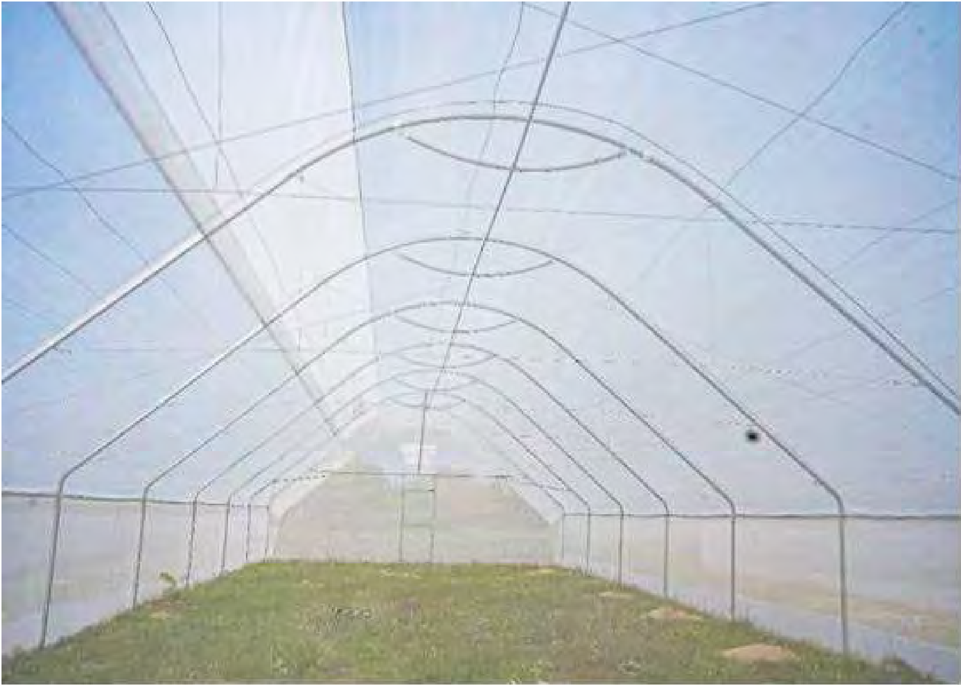
The Greenhouse modern day technology farming in Topo Island

the region. Topo Island, historically known for its coconut plantations and missionary heritage, is now poised to become a hub for modern agriculture practice. This strategic initiative reflects Whingan's vision for a self-sufficient and economically thriving agricultural Badagry Federal Constituency.