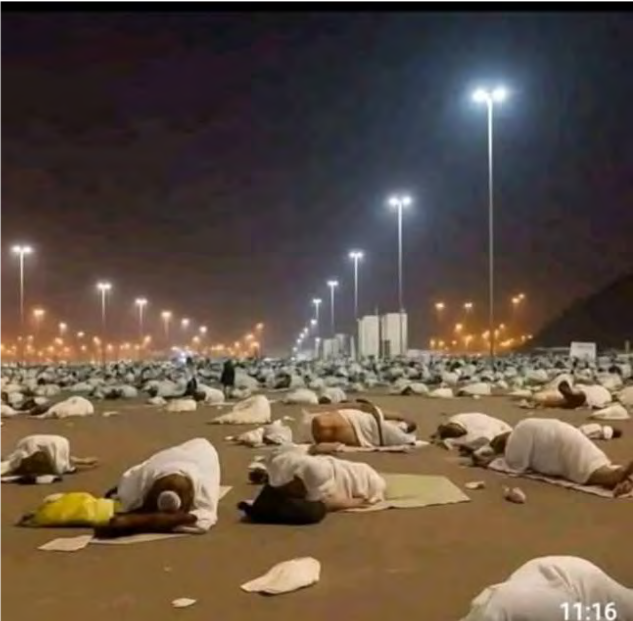
Pilgrims resting to prepare for another spiritual rites