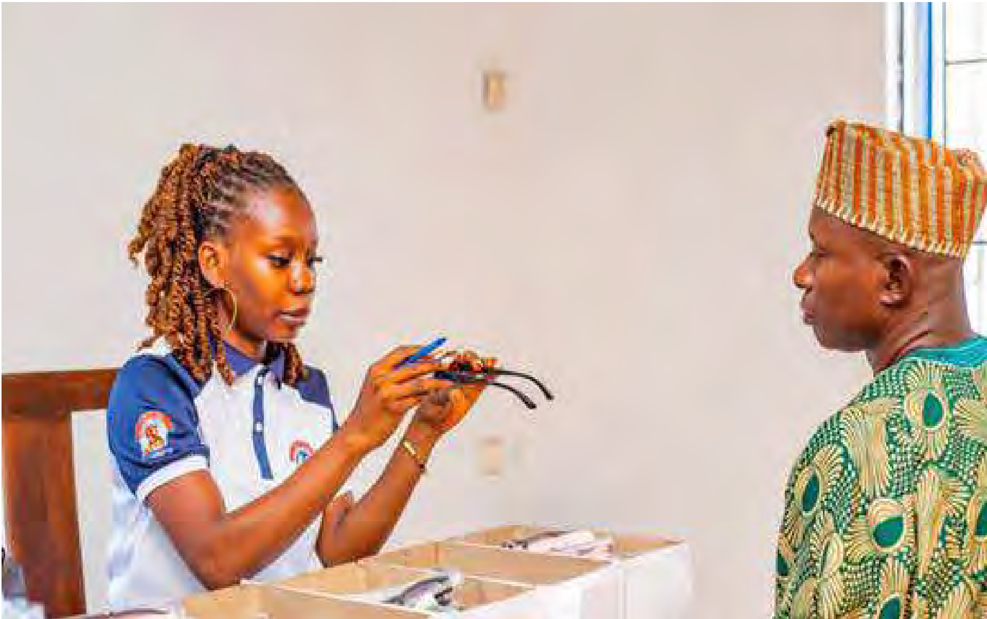
A medical practitioner attending to a resident of Badagry during the free medical outreach